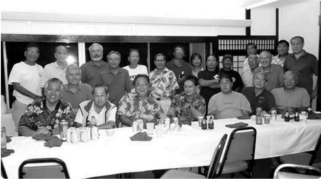
McKinley gang reunion 2008